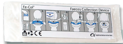
Stool collection paper